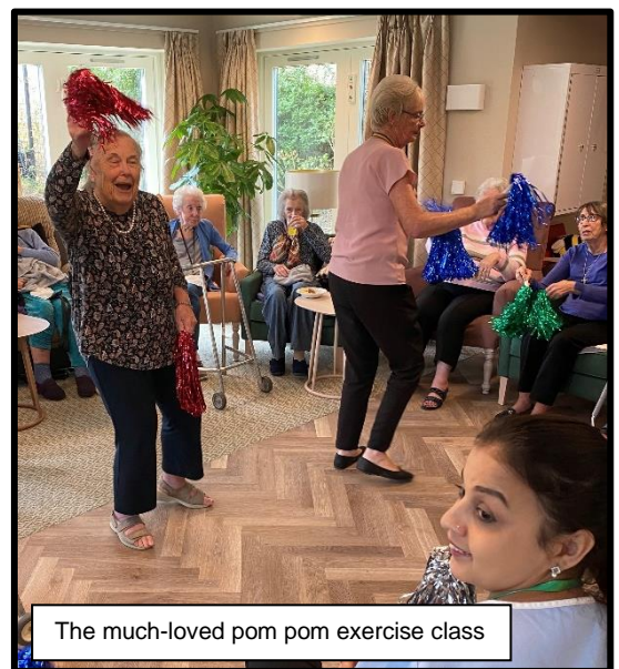
The much-loved pom pom exercise class