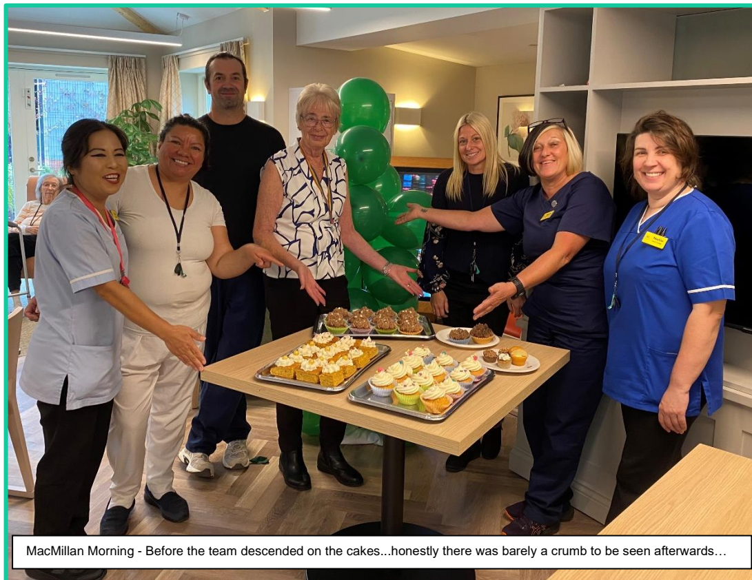
MacMillan Morning - Before the team descended on the cakes...honestly there was barely a crumb to be seen afterwards...

Since just before moving in we have been extremely keen to start marketing our fantastic new home. We had to wait for a few key things to conclude, for example the railings out the front, before we could embark on professional photography. We should be in a position to commence this over the next few weeks and from there, our professional website designer will launch a brand-new website for us – how exciting! We are on the case, but like everything it takes a little time. As soon as we launch our website we will let everyone know! Hopefully for the end of the year. What a start to 2025 that will be!